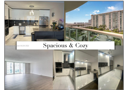
Spacious & Cozy