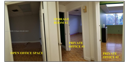
OPEN OFFICE SPACE