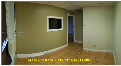
MAIN ENTRANCE RECEPTION / LOBBY