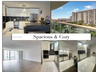
Spacious & Cozy