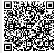
Solaris at Brickell Bay

1,145 Sqft - 186 SE 12th Ter # 1205, Miami, Florida 33131